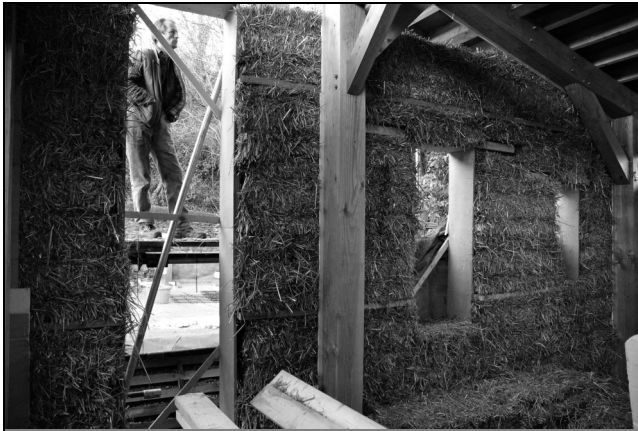
Figure 1. Structural timber framing with non-load-bearing straw bale walls sitting on cantilevered floor joists to provide a continuous insulating external envelope

be stored in dry conditions and other weather-dependent building operations can take place. Figures 1 and 2 show a timber-framed non-load-bearing straw bale building during construction. Note the timber upright members supporting the roof and the box-outs and inserted lintels to cater for the structural issues around doors and windows, and the insertion of straw bales between the horizontal timbers.